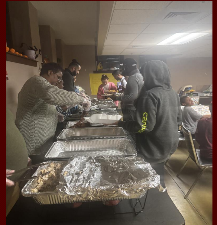
North Star staff sharing a meal with the families we serve in our community